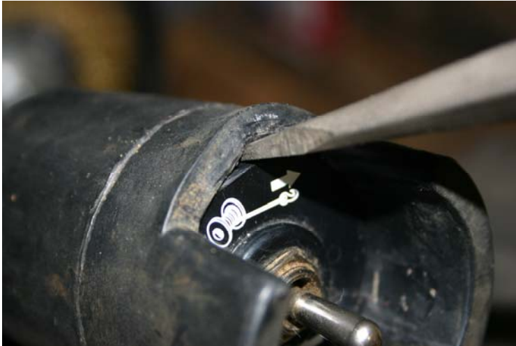
Figure 5 - removing the switch assembly from the handle

Now for the actual controller end...it's a big rubber handle with a switch mounted