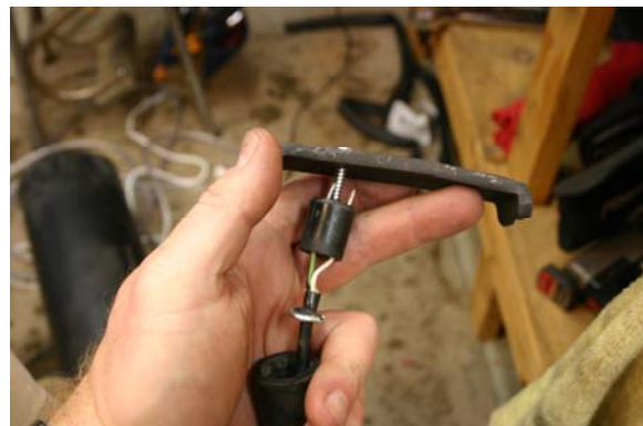
Figure 2 - the plug removed from the shell

I was unable to find the exact same wire as the original. I did find, at