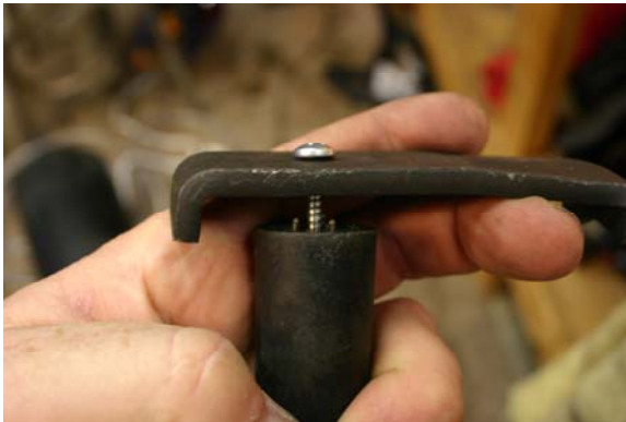
Figure 1 - The homemade "puller"

The hard problem is disassembling the connector on the winch end. Its not really meant to be taken apart. But after a while I discovered that I could run a #8 woodscrew into the center hole of the plug inside the connector shroud and, like a small "puller", the screw would pull the plug right out of the shell.