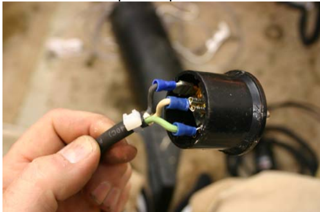
Figure 6 - the switch housing ready to go back into the handle

Gently pull the cable back through the handle until the switch housing is snug in the handle. Make sure you align the tab on the switch housing with the slot in the handle so that the switch operates in the correct direction. Getting the switch housing back into the handle is sort of a wrestling match. Lay the handle down so you can apply pressure to the face of the switch plate. Don't press on the switch itself, you can break it easily.