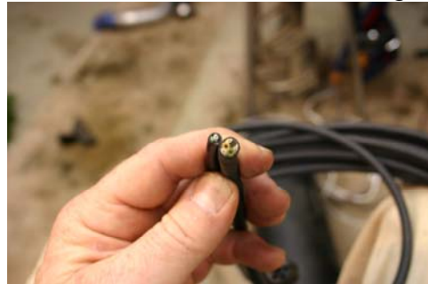
Figure 3 - new cable versus the original

Home Depot, a similar wire, but its slightly larger in diameter, and has reinforcing fibers which should make it stronger than the original. Its also rubber coated, so it looks and feels just like the original. Note the difference in diameter in the Fig 3. The replacement cable was 18/3 which means its 3 conductors (just like the original) and 18 gauge. I think the original was probably 22 gauge, so this is stronger wire as well as the whole cable being much stouter. Also this cable has included strain fibers between the conductors which should give it a lot more tensile strength.